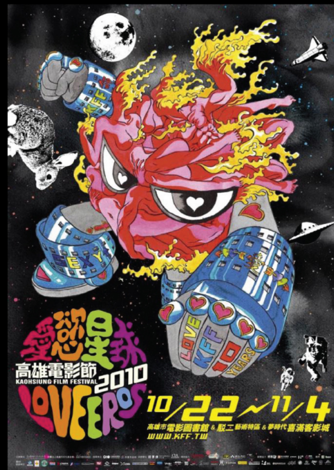
Kaohsiung Film Festival Fireball Brother Primary Visual

Undoubtedly, the year 2008 was the watershed of Taiwan movies. Before that timeline, it was a rare thing for a Taiwanese movie with ticket sales over NT$100 million. The 2008 "Cape No. 7", directed by Wei Te-Sheng, with a record of NT$500 million ticket revenue, along with the remarkably reputed "Orz Boyz!", infused heating enthusiasm to Taiwanese movies. Similarly, the 2010 "Monga" starring by Ethan Juan and Mark Chao seemed to smell new local stars and new sentiment about Taiwanese movies. It was not until 2011, there were three grand work of movies with ticket revenue over NT$100 million each: "Seediq Bale", "You Are the Apple of My Eye", and "Night Market Hero". They made a Taiwan movie fever, seemingly that Taiwan movies were gearing up with ticket revenue and reputation. However, that was not the case.